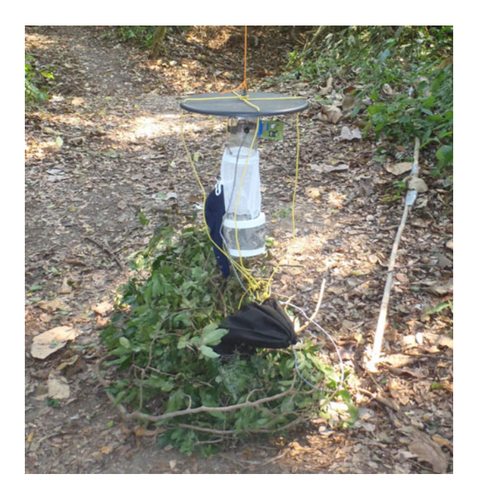
Fig. 1 Species Cynometra alexandri was used as material for artificial SP construction and associated with a CDC Miniature Light Trap within the riverine gallery forest of Semliki, Uganda

During a 6-month study period (August 2010–January 2011), we employed multiple CDC Miniature Light Trap Model 512 (with PhotoSwitch and Air-Actuated Gate System) within the Semliki gallery forest habitat to capture flying insects. The PhotoSwitch and Air-Actuated Gate System allowed traps to automatically activate at dusk (1905 hours) and deactivate at dawn (0700 hours). For the purpose of this study, we set two paired traps on the same night to test whether the construction of Cynometra SPs reduce exposure to flying arthropods. The first trap, hung 1 m from the ground, had a fresh Cynometra SP constructed and placed underneath (Fig. 1). The second control trap, placed within the same microhabitat