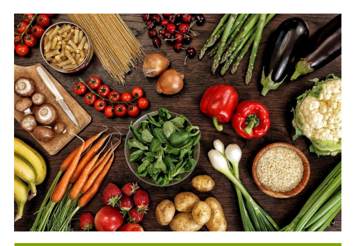
In Canada, only an estimated 4% of the population is vegetarian.