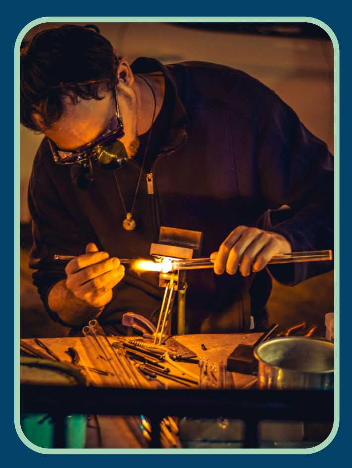
Space uses: Advanced manufacturing, maker spaces, coworking spaces, entrepreneurship center, incubator/accelerator

2) Advanced Manufacturing & Maker Spaces