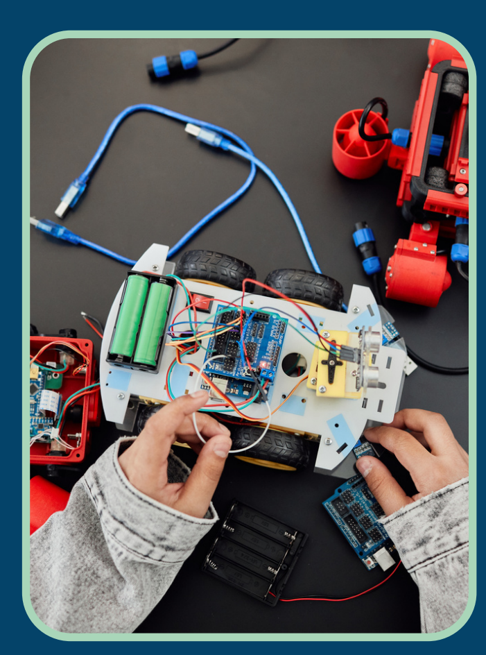
Space uses: Technology company, aerospace research center, incubator/accelerator, coworking space

2) Advanced Manufacturing & Maker Spaces