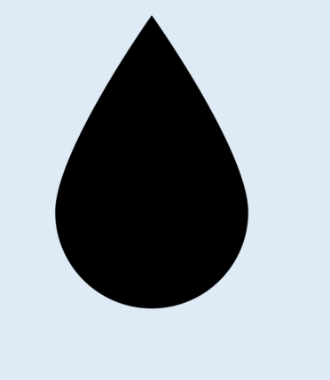
Economic Law Energy & Policy