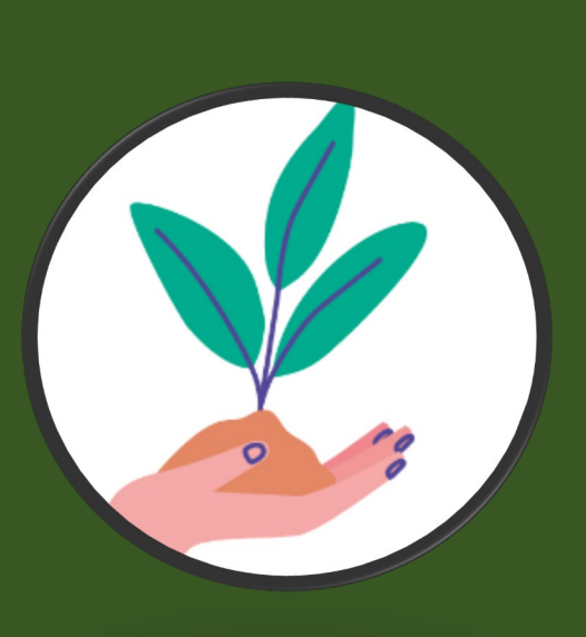
Packaging & Waste Audits