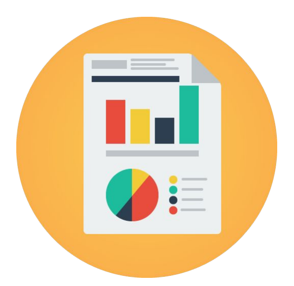
Regulatory Updates & Reporting