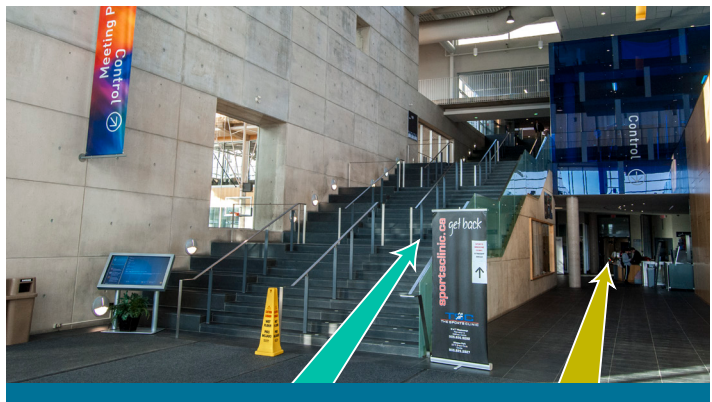
2. Proceed up the stairs to the William G. Davis Building, or proceed to the end the hall to access the elevator and take it up to the second floor.