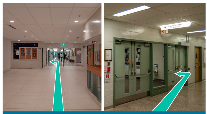
4. Proceed through the green doors on the left side of the hallway.