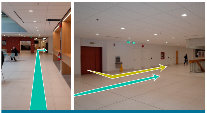
3. If you took the stairs, head straight through the Meeting Place and turn right. If you took the elevator, turn left.