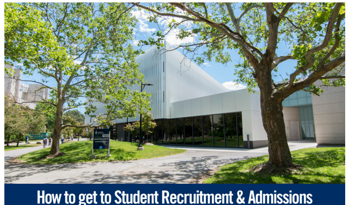
How to get to Student Recruitment & Admissions from Parking Lot 4 or 8