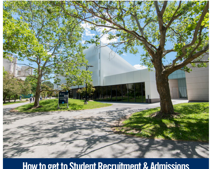
How to get to Student Recruitment & Admissions from the St. George Shuttle Bus Stop