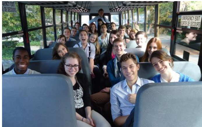
TDS and MTP students arrive at Shaw Festival (September 2013)