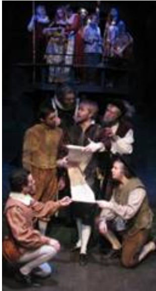
Petruchio and the men read the demands of the women, who are fortified above ( Tamer company)