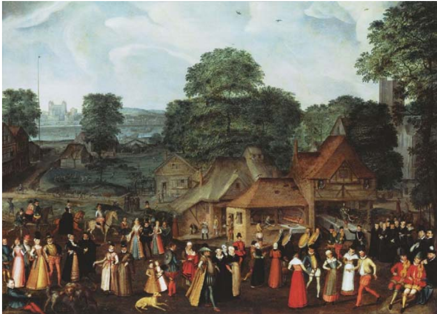
Hoefnagel: Wedding Fête at Bermondsey , 1569 (note the Tower of London in the background)