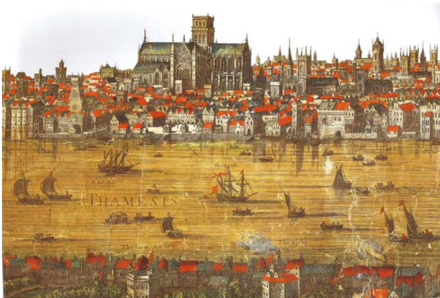
Bankside in the early 1600s (note St. Paul's in the distance and the Curtain and Globe theatres in the foreground)