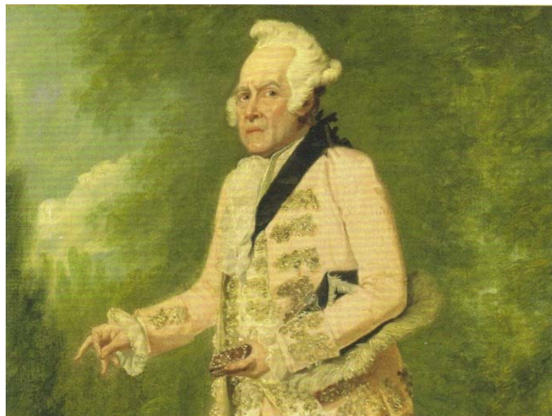
Thomas King as the original Lord Ogleby, Drury Lane 1766