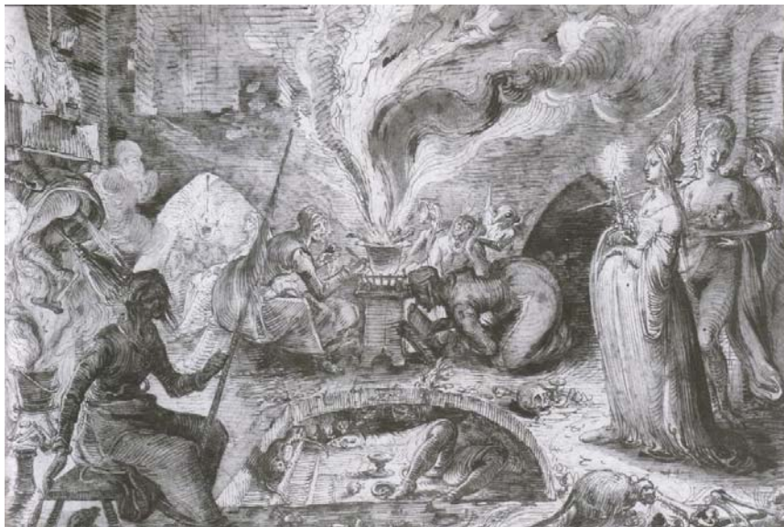
A 17 th -century coven of witches

We hope that the members of our audience can enjoy following these eight main characters without necessarily needing to figure out exactly who they are when they switch to playing supporting roles for each other! Bon voyage!