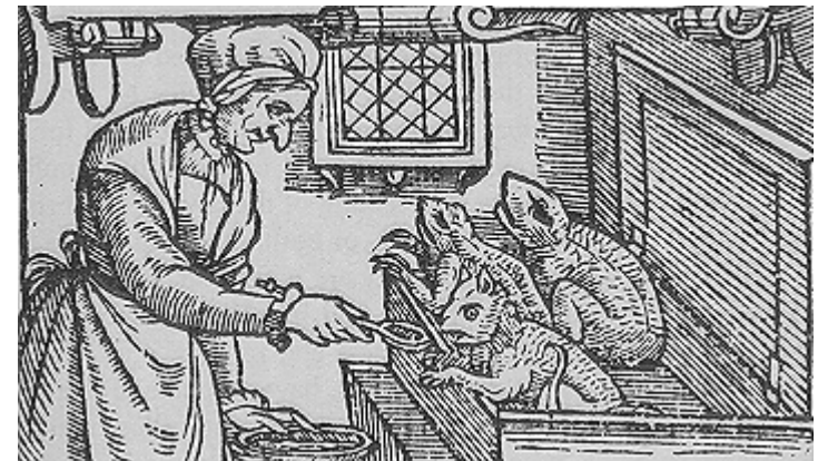
A witch with cat and toad familiars, 17th Century