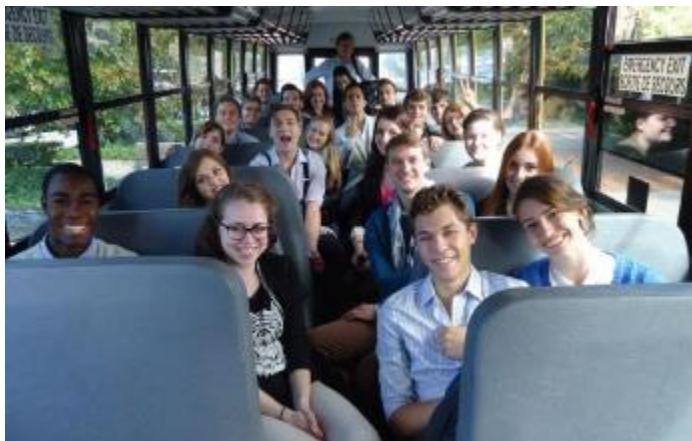
TDS and MTP students arrive at Shaw Festival (September 2013)