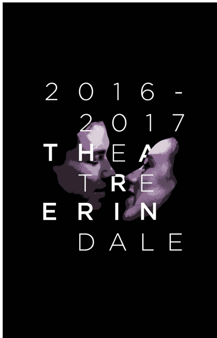
Our 2016-2017 Season Preview Flyer

What follows is an information booklet packed with key info for all four years plus faculty, staff, and recent grads. If you are new to our program you will find many questions answered and probably some new ones to ask!