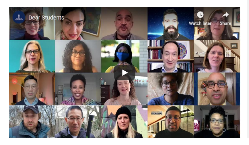
Nearly two dozen faculty members from across the University of Toronto's three campuses delivered messages of hope and support for students in a video released on Jan. 18 – a day dubbed "Blue Monday" for its reputation as a time of post-holiday blahs. Click <u>here</u> to watch the video.