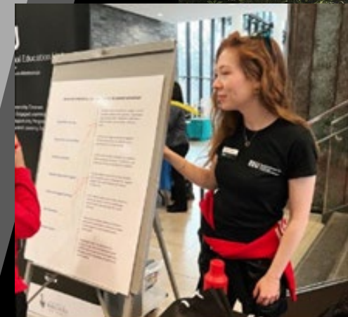
ROP Information Sessions