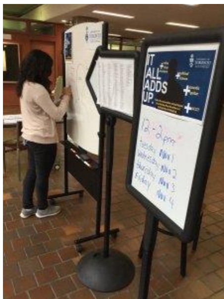
It All Adds Up at University of Toronto - Mississauga, 2016-17