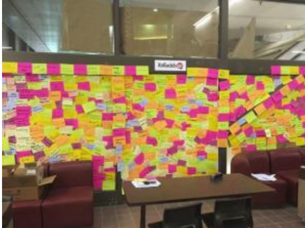
It All Adds Up post-it wall at University of Manitoba - Asper Career Development Centre (2016-17 campaign)[/caption]

Follow #italladdsup on Instagram and contact your campus career centre for more information about the campaign at your school!