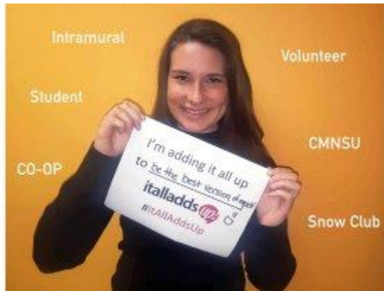
Student at Simon Fraser University, 2016-17 campaign

Sheridan College Career Centre -Oakville campus