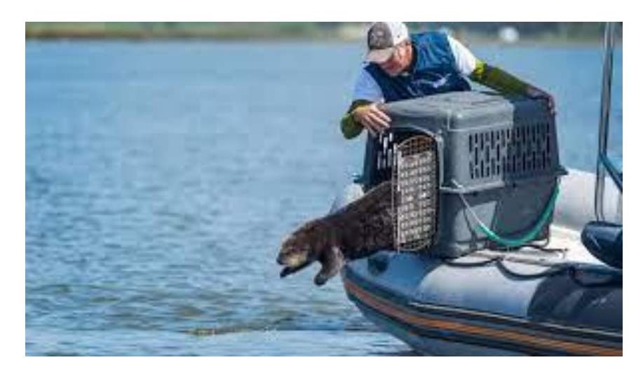
Figure 2: An otter raised in the Monterey Bay Aquarium's surrogate program being released into Elkhorn Slough for the first time (Monterey Bay Aquarium, 2019).

Figure 1: This graph plots average annual kelp density against average annual purple sea urchin biomass across 436 sites along the Aleutian archipelago from 1987-2006. Circles indicate low-density sea otter populations (<6/km), while squares represent high-density sea otter populations (>6/km), displaying a positive correlation between high-density otter populations and kelp density, as well as a negative correlation between high-density otter populations and urchin biomass (Estes et al., 2010).