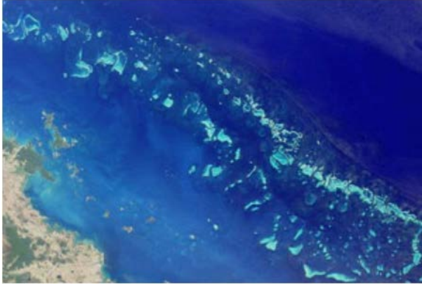
Fig 1. The Great Barrier Reef as seen from outer space. (source: Australia's Great Natural Wonder, n.d.).

The Great Barrier Reef (GBR) is one of the Seven Natural Wonders of the world with the largest coral reef on the planet—so large that it can be seen from outer space (see Figure 1) (Australia's Great Natural Wonder, n.d.). Aside from being a popular tourist attraction, the reef is a very rich and biologically diverse ecosystem that is home to more than 3000 reef systems, 400 different kinds of coral, 1500 species of tropical fish, 200 bird species, 20 species of reptiles such as sea turtles, and many more marine animals (About the Great Barrier reef, n.d.; Australia's Great Natural Wonder, n.d.). The GBR acts as an important refuge, breeding ground, and nursery ground for many marine animals, plants, fungi, and bacteria (About the Great Barrier reef, n.d; Hoegh-Guldberg, 2010; Veron et al., 2009).