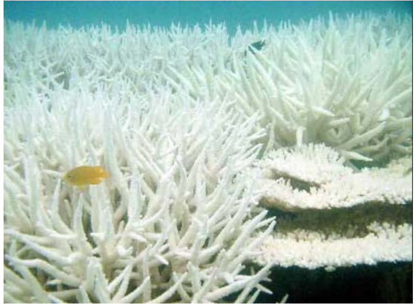
Figure 3 a photograph of bleached corals