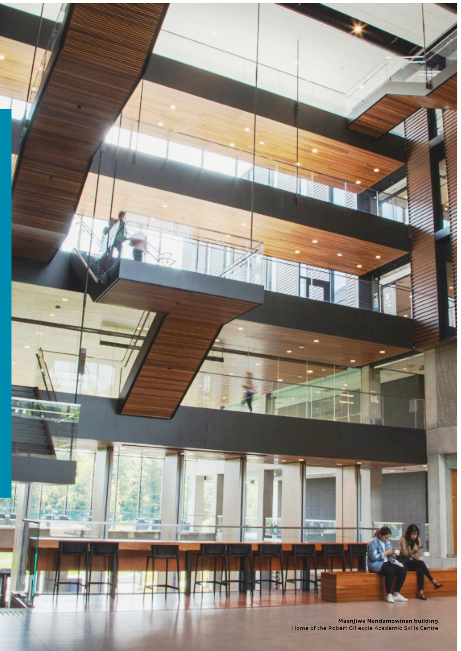
Maanjiwe Nendamowinan building. Home of the Robert Gillespie Academic Skills Centre.