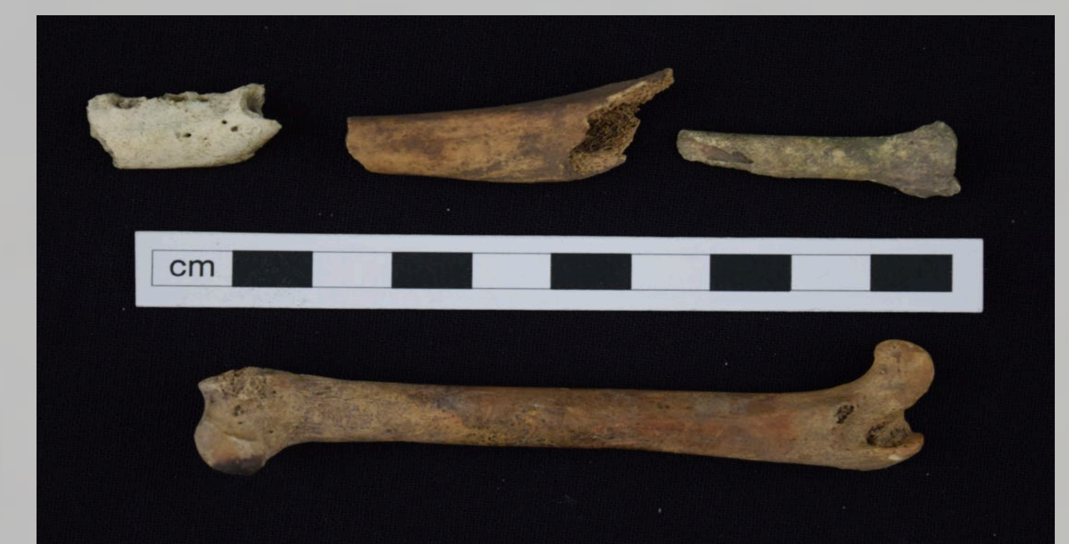
Figure 3: Felis catus remains identified from SWP.