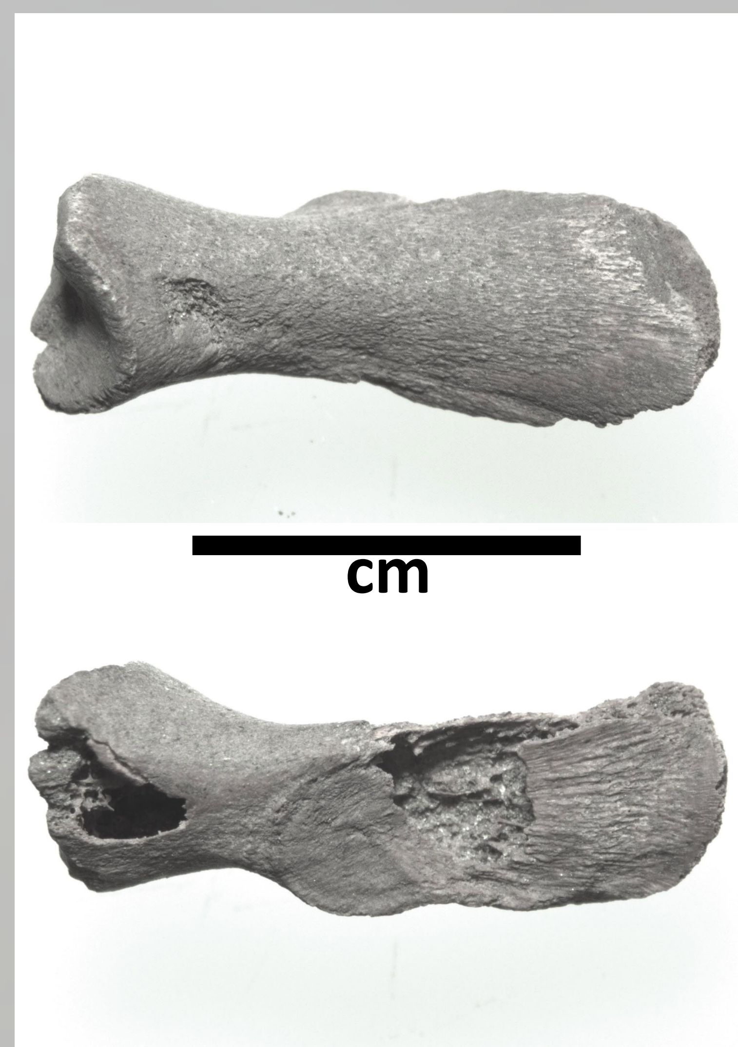
Figure 1: Leporid right ilium with likely predator damage.