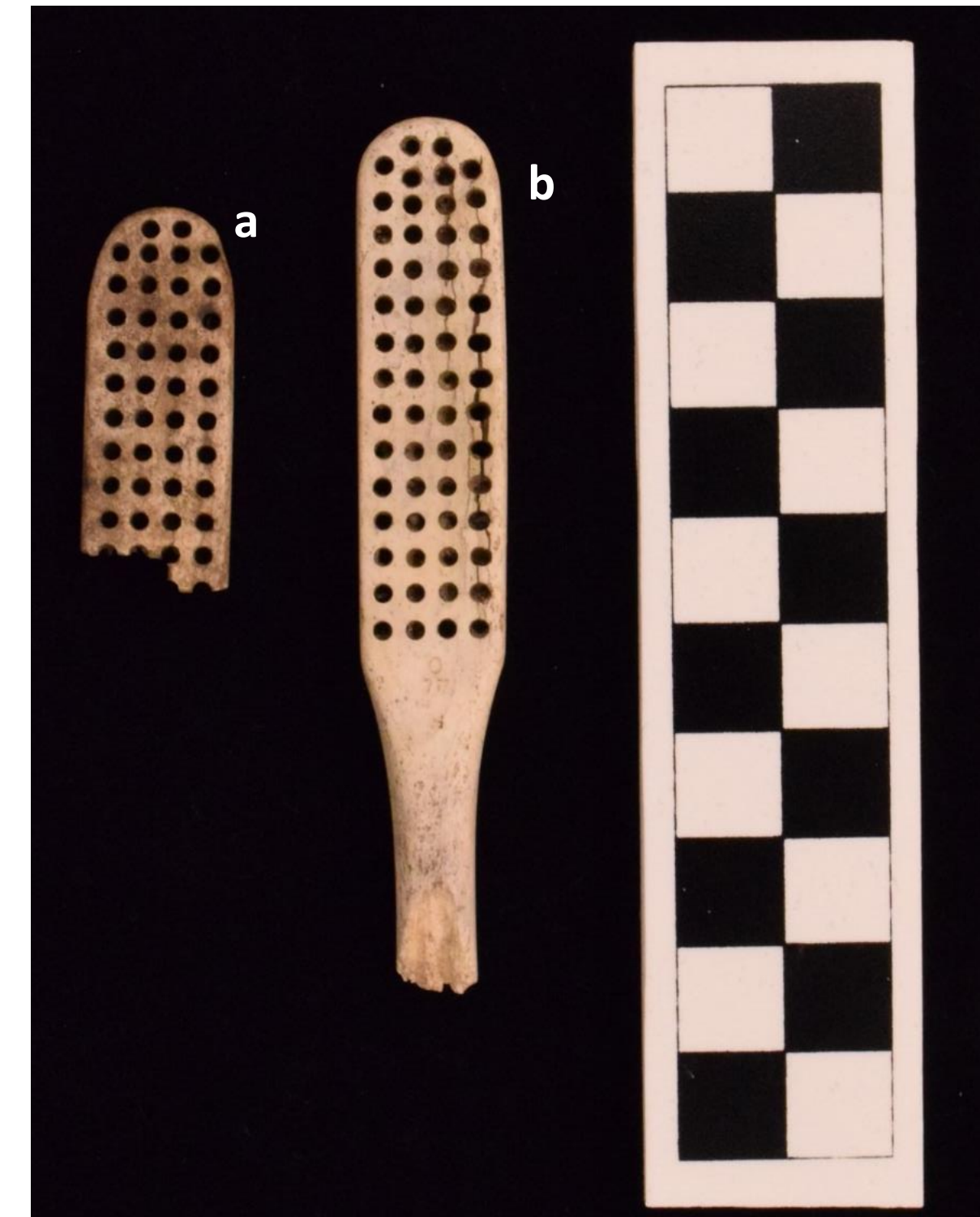
Figure 2: Similarities between toothbrushes from AjGw-535