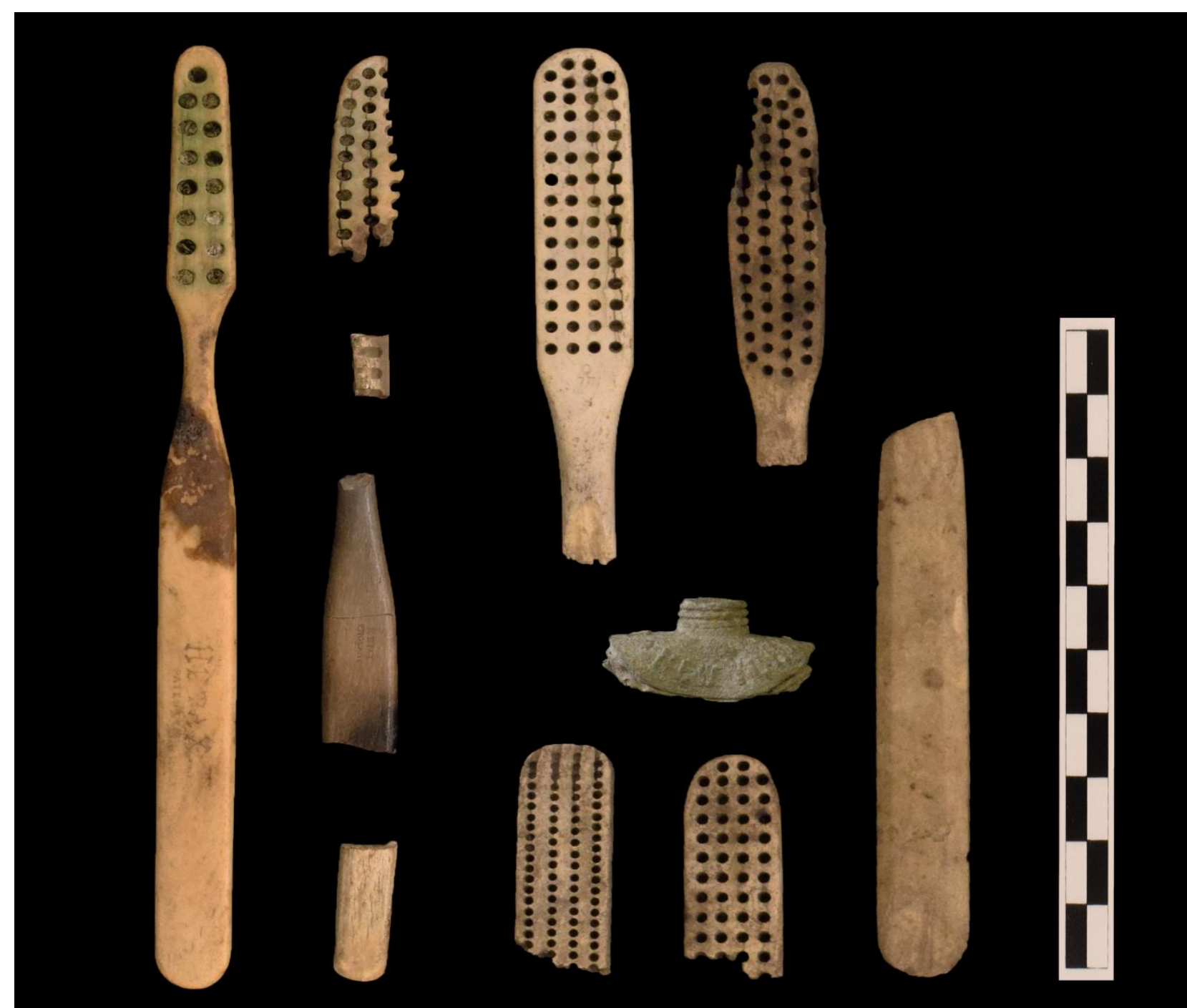
Figure 1: Dental hygiene artifacts