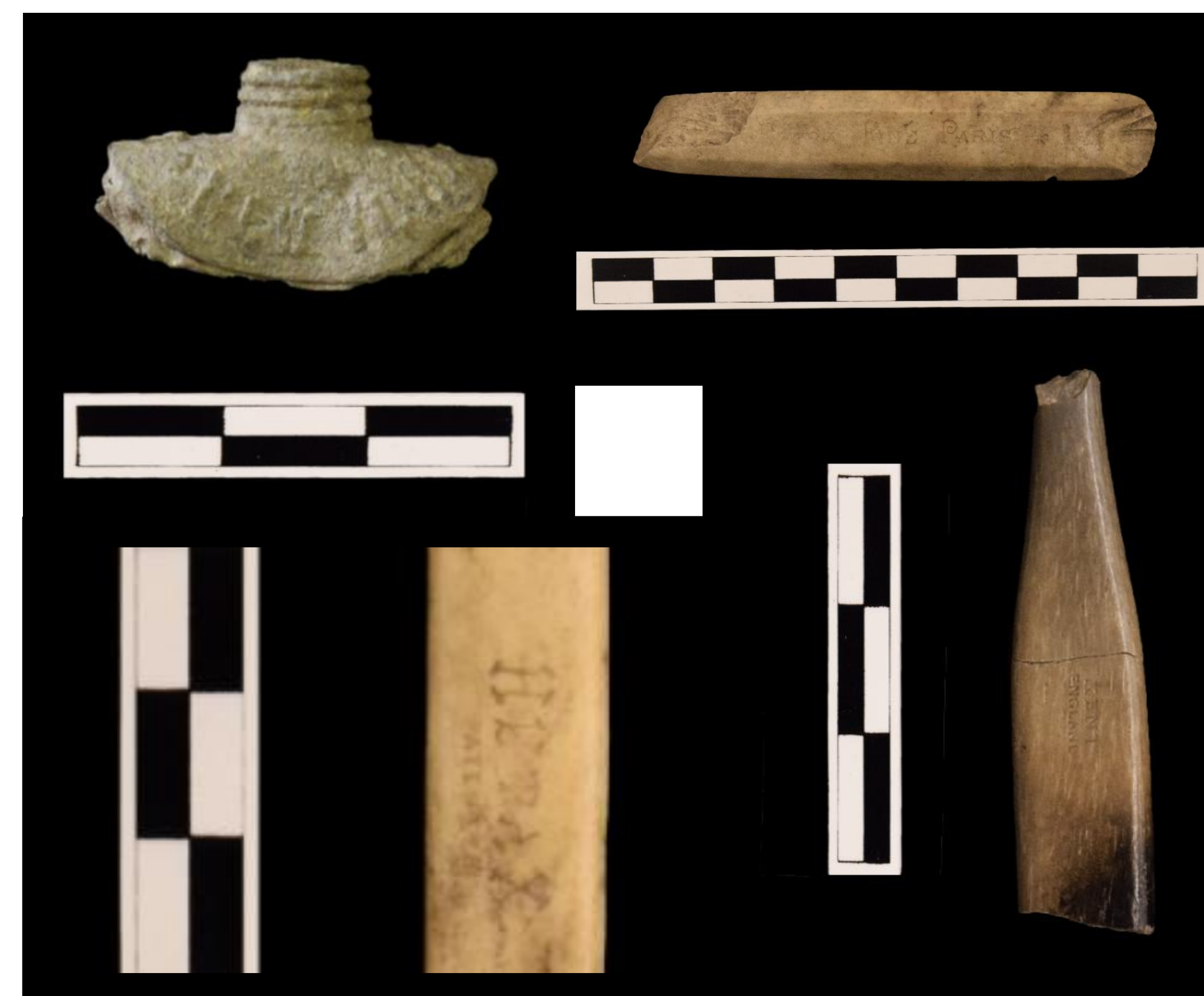
Figure 3: Slogans and Manufacturers: Colgate toothpaste tube (Top Left); toothbrush handle with "Extra Fine Paris" engraved (Top Right); Hutax toothbrush (Bottom Left); Kent toothbrush neck (Bottom Right)