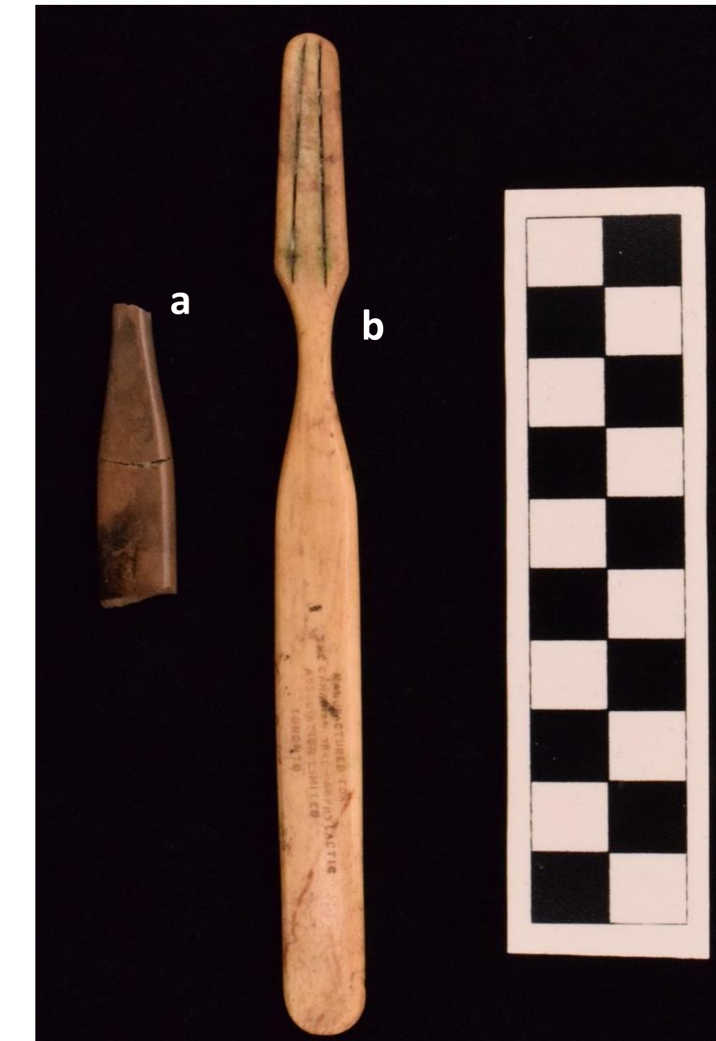
Figure 3: Similarities between toothbrushes from AjGw-534