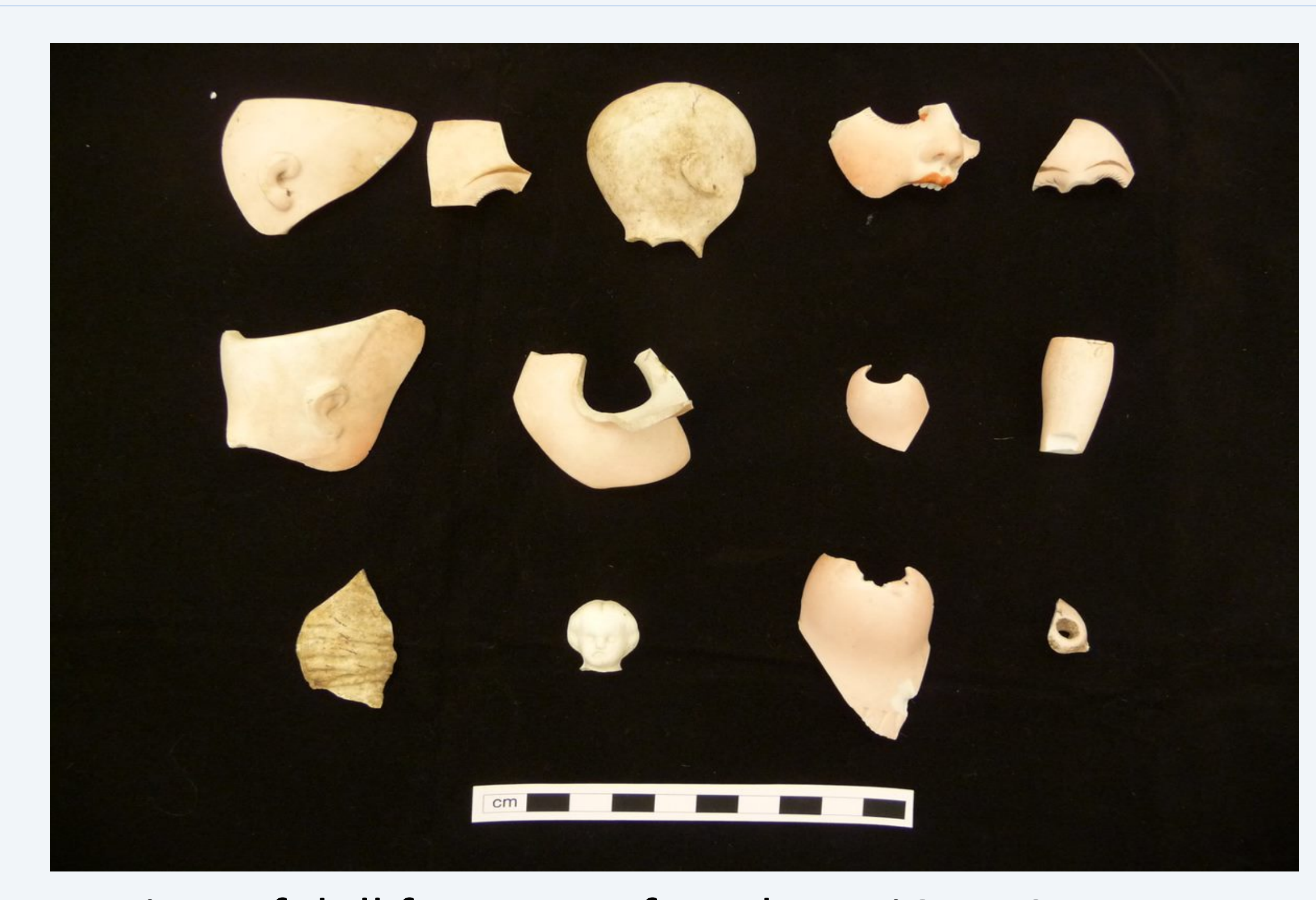
Figure 1. Variety of doll fragments found on AjGw-535