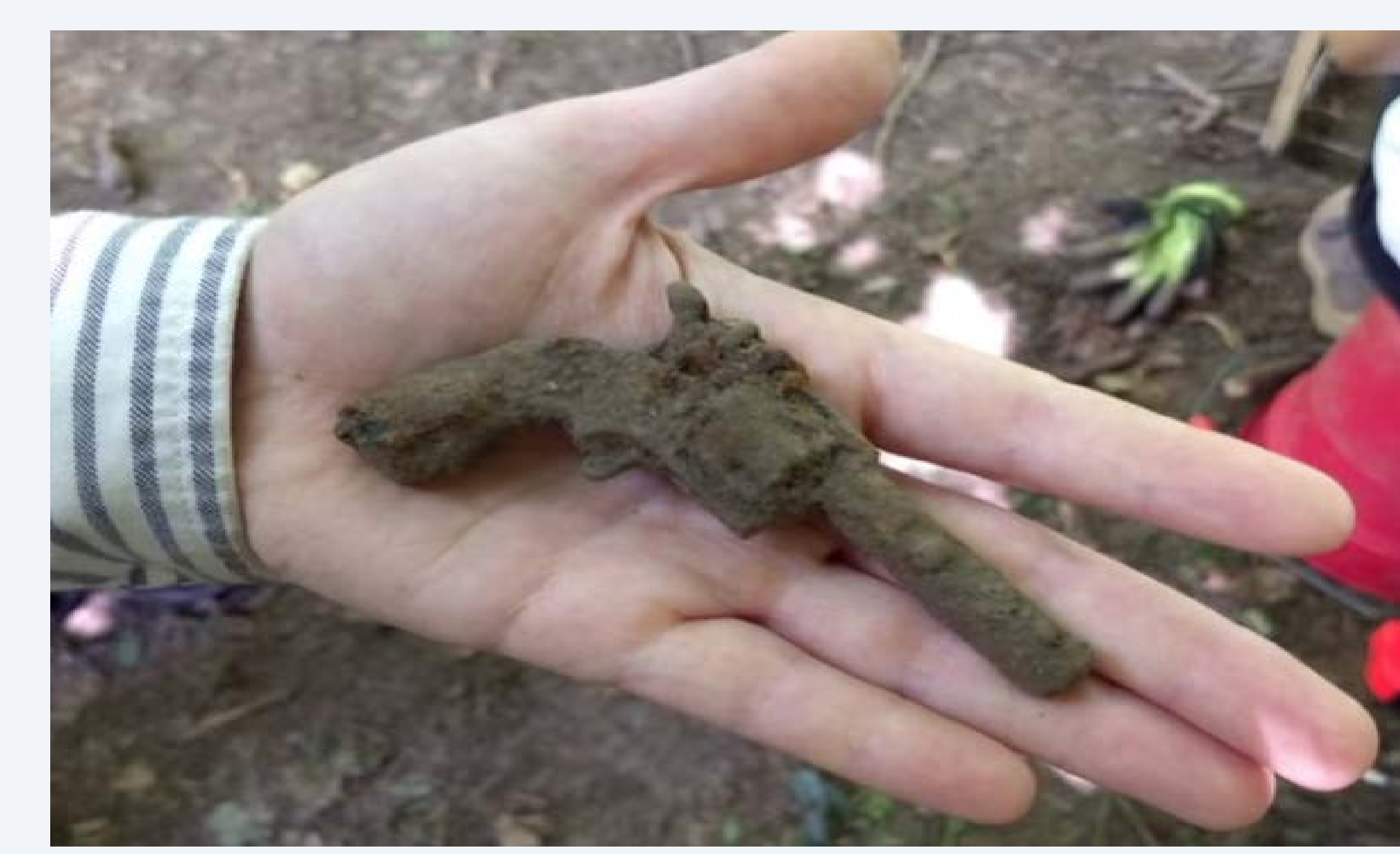
Figure 2. Metal toy pistol found at AjGw-534

The artifacts were collected by test pitting, unit excavation, and surface collection (at AjGw-535). This poster examines and provides preliminary interpretations based on children's toys from the 2013-2019 field seasons with the artifact found at these sites.