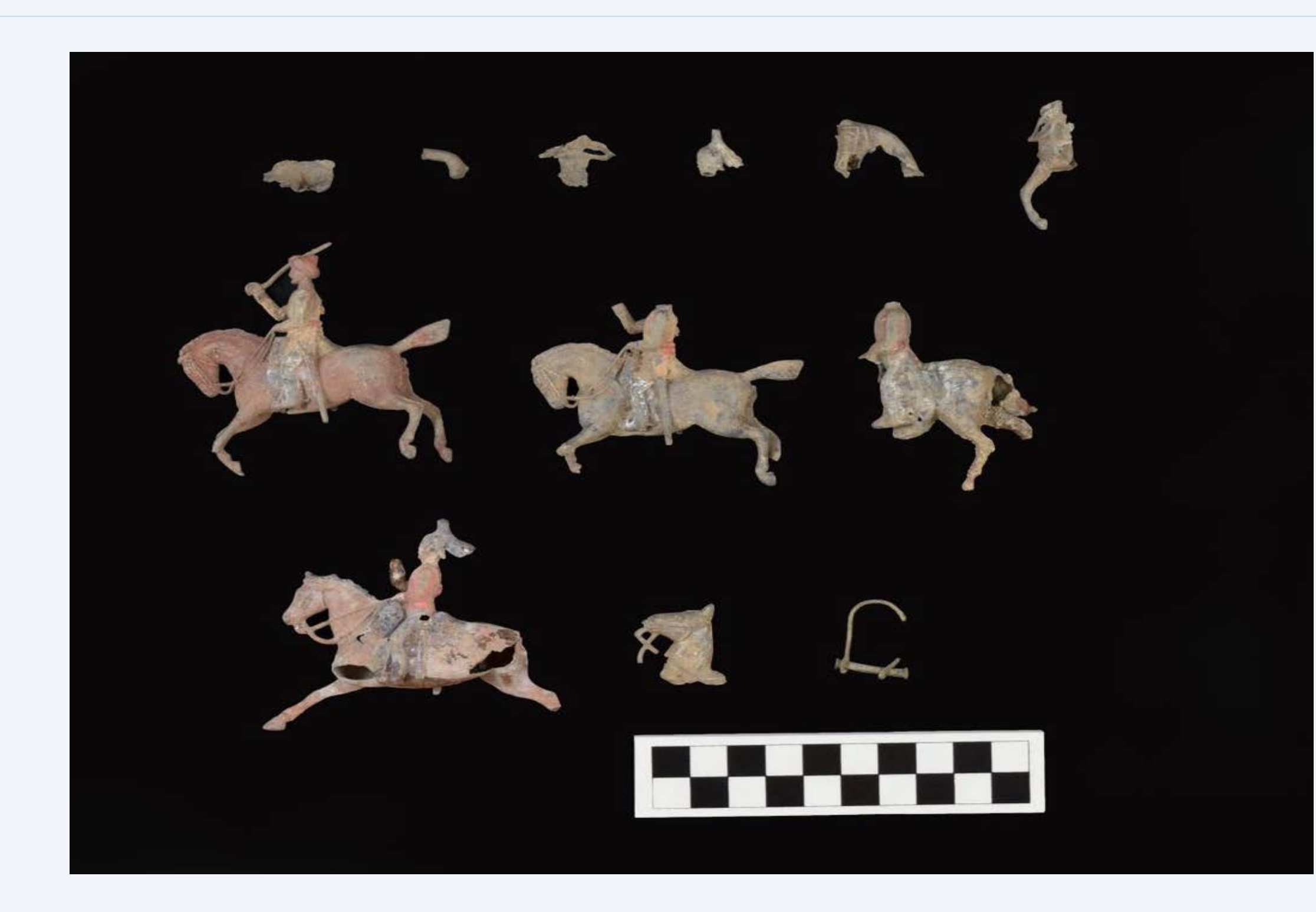
Figure 5. Example of toy soldiers found at AjGw-534