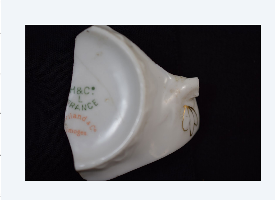
Figure 1. Dating chart based off Haviland Makers Marks (Holland, 2006, left). Image of the sherd from Schreiber Wood Project (right)