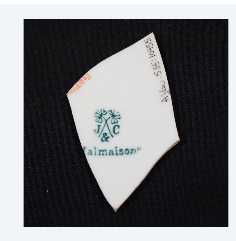
Figure 2. Image of Jaeger and Co. sherd from Schreiber Wood Project

Jaeger and Co. was a porcelain manufacturing company based in Germany that operated from 1872 to 1986 (Marshall, 2004). Throughout this time, transitioned from a small decoration company to a tableware/giftware shop. The maker's mark on the pieces of flatware from our collection (Figure 2) dates this vessel from 1872-1898. There is no sign that these vessels were available for sale in Canada or England, so it is possible that this vessel was brought back, or ordered from, Germany.