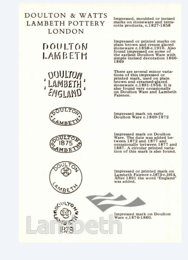
Figure 4. Image of Doulton Lambeth sherd from Schreiber Wood Project (left). Dating chart of Doulton and Lambeth makers marks (Lambeth Archives, 2020, right).