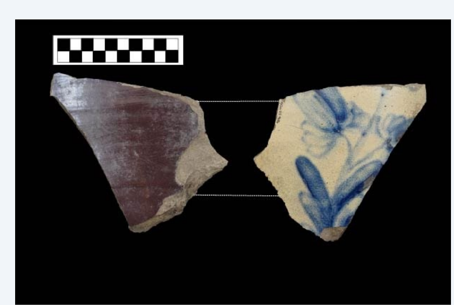
Figure 3. Image of Brantford Pottery from the Schreiber Wood Project