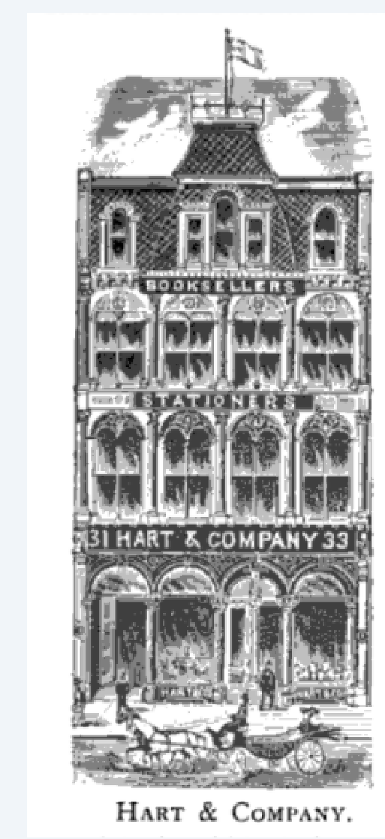
Figure 6. Image of China Hall (Blauberg, 1992, left). Image of Hart & Company (Mulvaney, 1884, right).