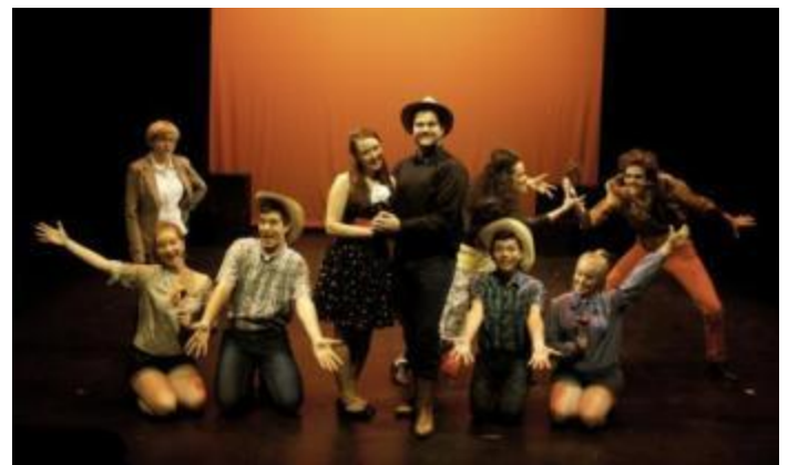
The cast of Untitled: the Musical (Beck Festival 2012)