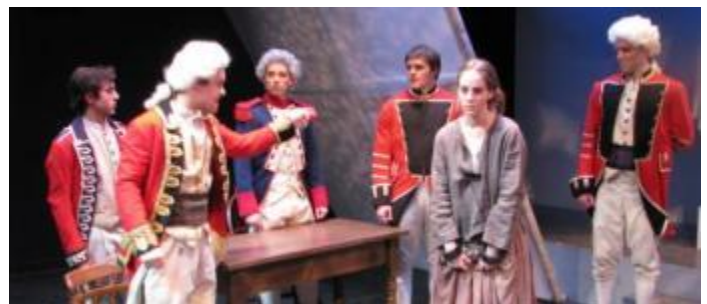
Our Country's Good (2012)

A SPECIAL PLEA TO NEW FIRST YEAR STUDENTS! – PLEASE PLEASE wait until Saturday morning the 22nd to run home to Mother after your first two weeks at university. She won't go away, but your first and last chance before April to party with all your new colleagues will! Besides, we all want to get to know you. So don't be too stuck up or too shy to join us!