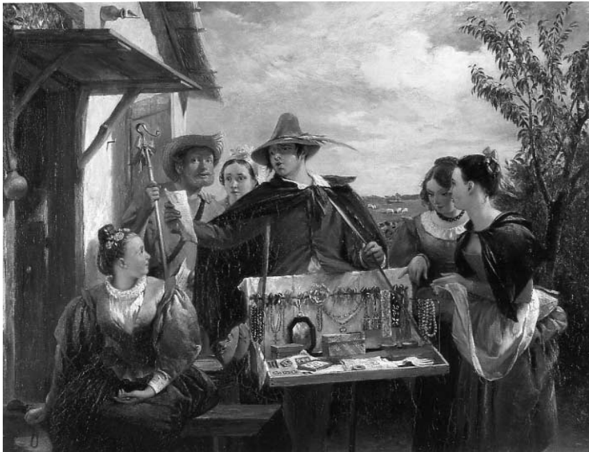
Charles Robert Leslie, Autolycus (1836) - Victoria & Albert Museum